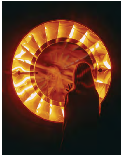
Light Art Museum, Eye See You by Ólafur Eliasson