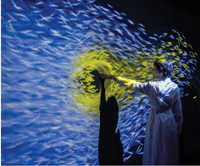
teamLab, The Way of the Sea: Flying Beyond Borders © teamLab