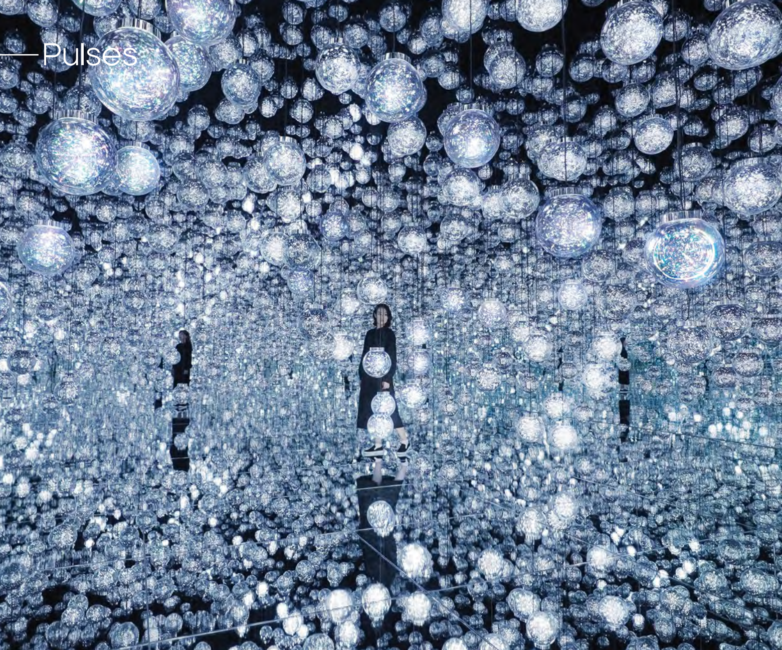
teamLab, Bubble Universe: Spherical Crystallized Light, Wobbling Light, and Environmental Light - One Stroke © teamLab