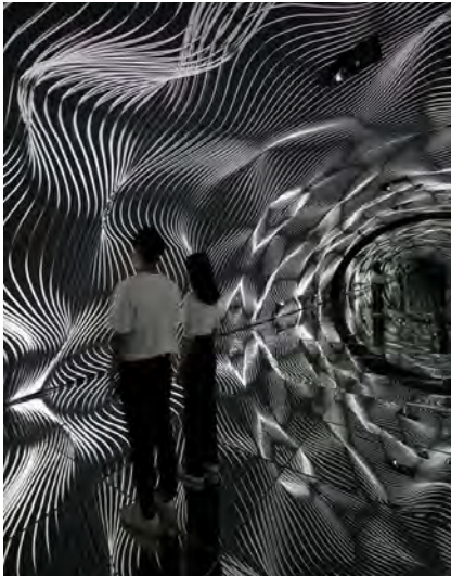
Arte Museum, Cave