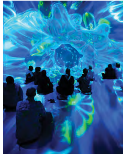
Artechouse, Twilight Zone